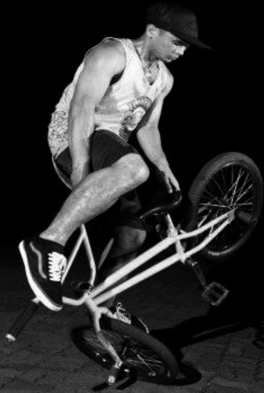
Renz VIAJE